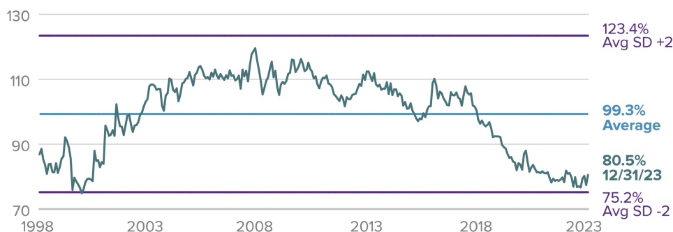
Russell 2000 vs. Russell 1000 Median LTM EV/EBIT 1 (ex. Negative EBIT Companies) 12/31/98-12/31/23

Fallout from the Internet Bubble saw small-caps need 456 days from their trough to match their previous peak, while it took 704 days for small-caps to recover their prior peak following their trough in the 2008-09 Financial Crisis. Each of these periods saw dramatic developments: the implosion of high-flying technology stocks in 2000-02 and a global financial catastrophe in 2008-09. The current period has seen ample uncertainty, and a record pace of interest rate increases yet lacks the existential threats that characterized the Internet Bubble and, even more so, the Financial Crisis. The latter period also saw less bifurcation between small- and large-cap returns. Yet based on our preferred index valuation metric of enterprise value to earnings before interest and taxes, or EV/EBIT, the Russell 2000 finished 2023 not far from its 25-year low relative to the Russell 1000.